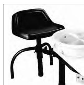
The Seat: Comfortable, supportive, and adjustable up, down, toward and away from the wheel. This padded, steel seat works on Pacifica and other wheels too!