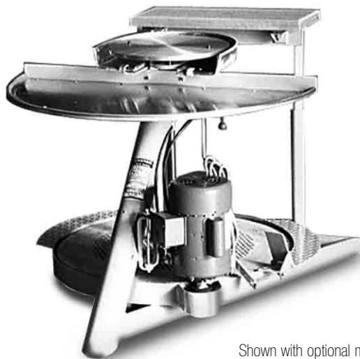
Shown with optional motor

This kit can convert the standard Lockerbie Kickwheel into a motorized model. This kit only fits Lockerbie wheels with serial numbers following No. 2894 (same as motor described above.)