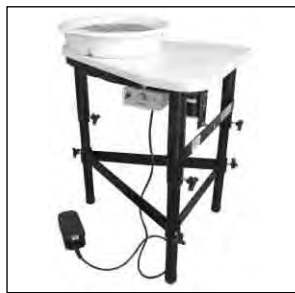
Leg Extension B: Adds 11 to 23 inches - for stand-up throwing. Wheel head height: 30-41".