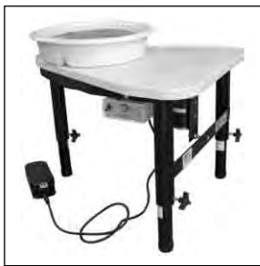
Leg Extension A: Adds 1 to 10 inches - you sit up higher, reducing strain on lower back.